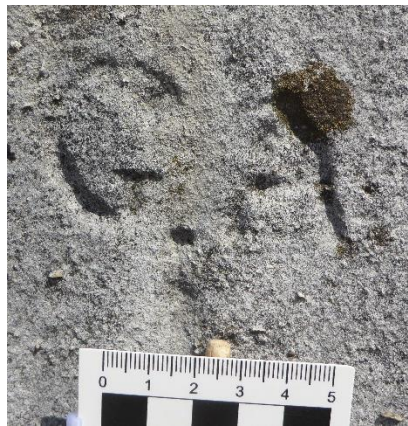
1 Initials GA on roof merlon

This survey supplements an earlier survey of the Bargate's ground floor. Very little graffiti is visible on the roof, probably due to weathering and replacement of stone. All that was found are the initials GA (Fig 1) and a possible arrow shape on the south face of one of the merlons of the inner battlement, on the north side of the Bargate. This graffiti was made on blocks of Portland stone, so was made later than 1912.