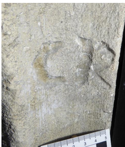
4 Initials CR on door frame at top of stairs

Modern graffiti is scratched into one of the concrete pillars next to the stage area, and more modern scratched initials, one set dating from the 1960s, are on the landing outside, around the window at the top of the stairs. Also in this area, deeply carved into the south side of the door frame, are the initials CR (Fig 4).