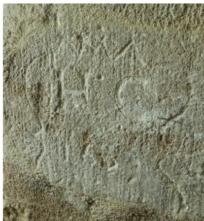
2 Dated and framed initials HC by window on upper floor

Two sets of initials were found next to windows on the south side. The initials HC, and a date which could be 1667 or 1662, are carved within a flamboyant frame on the west side of the most westerly of the windows (Fig 2).