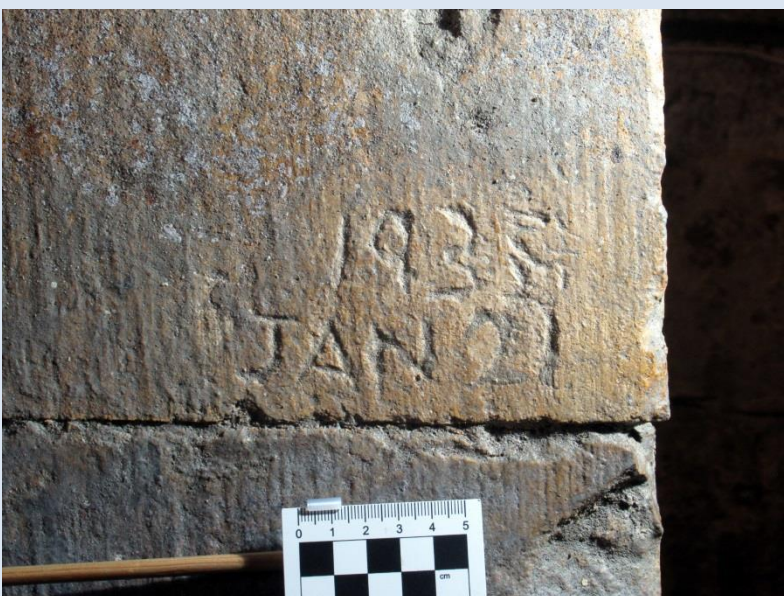
Fig. 3 – Incised “1935 JAN 21” on the north wall of the entrance at the east edge

Only three examples of graffiti were found.