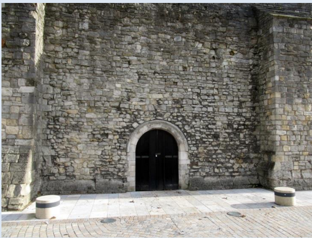
Fig. 1 – Entrance to Castle Vault

The vault is located at the northern end of southern section of Western Esplanade, Southampton. Erected in the mid to late 12 th century for royal wine storage it is an ashlar masonry construction built in several phases and has a roof of ribbed stone with rubble infill. This vault was used as an air raid shelter during the Second World War and later as a City Council masons' store. The only graffiti found were modern initials and 20th century initials and dates.