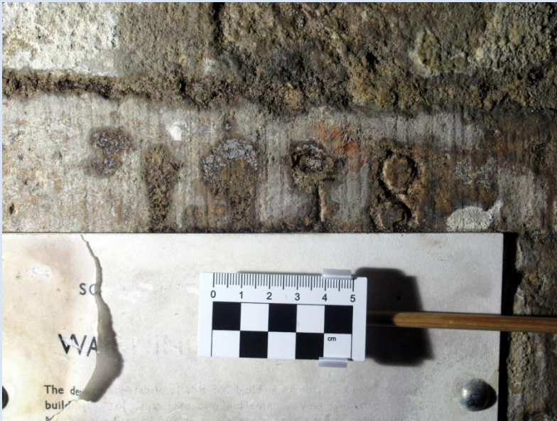
Fig. 4 – Incised “1998” on the south wall of the entrance at the east edge