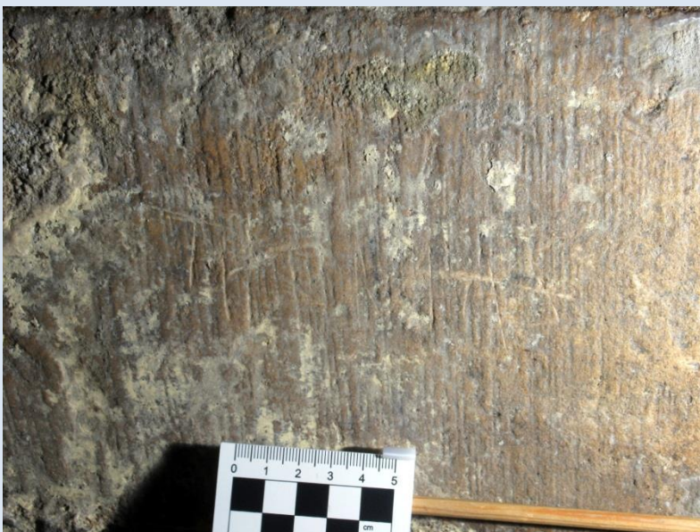
Fig. 5 – Faint scratched “THR” (?) on the west wall, adjacent to the south corner of the entrance