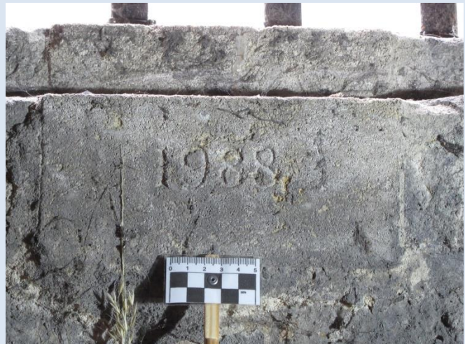
Date imprinted in concrete window sill.