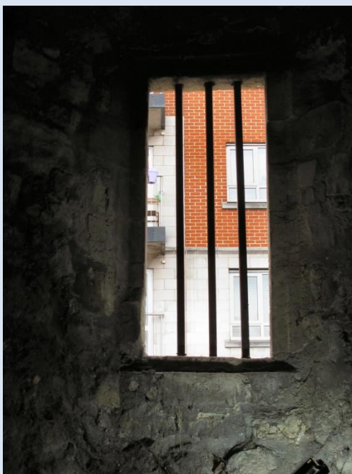
Barred window at Eastern end of vault where the date "1988" is imprinted.