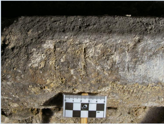
Faintly scratched "I R" and small "s" on string course.