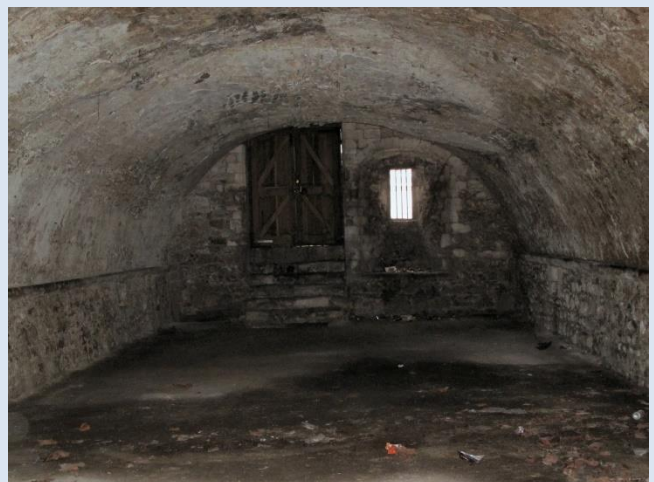
Interior view of vault looking east.

The remains of Quilters vault that are above ground.