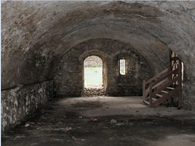
Interior view looking west