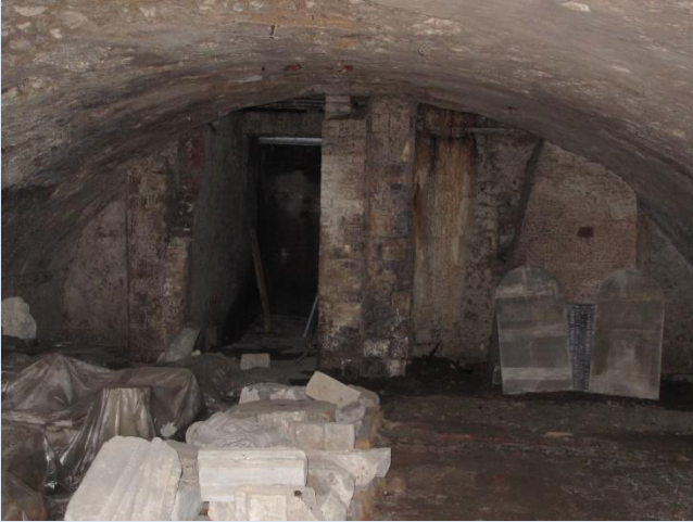
View of east end of vault with added reinforcement to entrance.