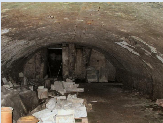
View looking east, the escape hatch can be seen to the right of centre, half way down.