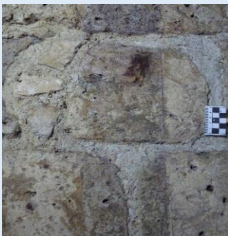
Detail of Pencil Line