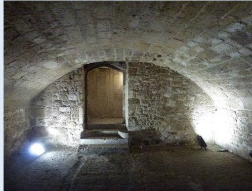
Eastern End of Vault