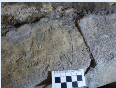
Line on exterior of East Door Arch

Very little graffiti was found. There was one curved scratched line, some scratched vertical and diagonal lines, incised letters and some red marks possibly crayon. One of the most interesting finds was a pencil line on the spur wall in the south recess. This was from the ceiling to the top of the bench and was presumed to mark the position of the toilet when the vault was used as an Air Raid Shelter during World War II.